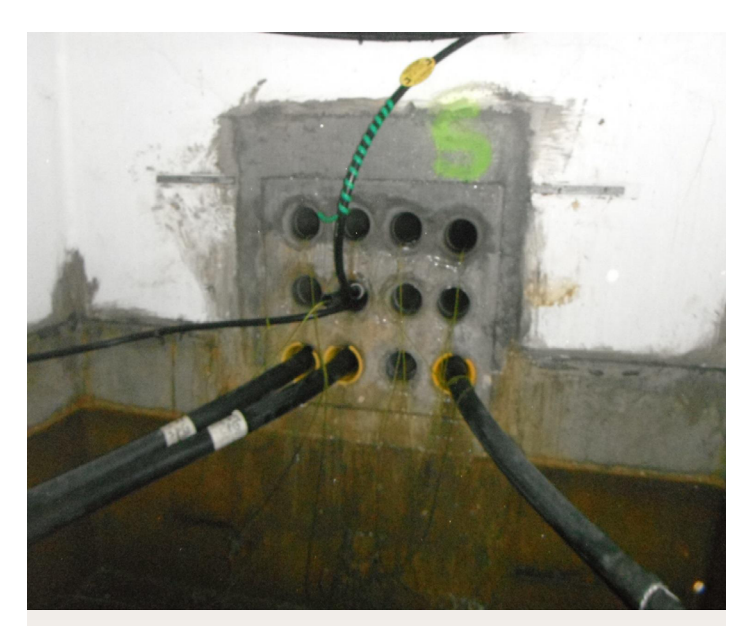
Fibre in duct sample