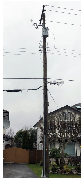
Mid pole wireless photo sample